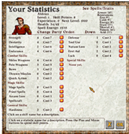
The Training Window

In the character roster, each character has a button to the right that says Info (if the character has no skill points) or Train (if there are skill points to spend). Pressing this button brings up the Training window.